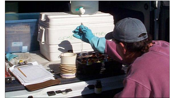
Sampling is necessary to monitor water quality and ensure compliance with pretreatment requirements.

The Fairfax County Industrial Waste Section (Telephone 703-550-9740, ext. 252 ) can answer your questions. These environmental professionals can provide you with information about regulatory requirements and pretreatment technologies. If you prefer, they can arrange to visit your facility to discuss how the National Pretreatment Program is applicable to your operations.