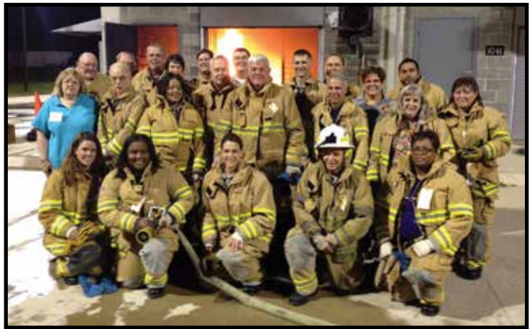
Community outreach . . . the second Citizens Fire and Rescue Academy gets underway with eager participants.