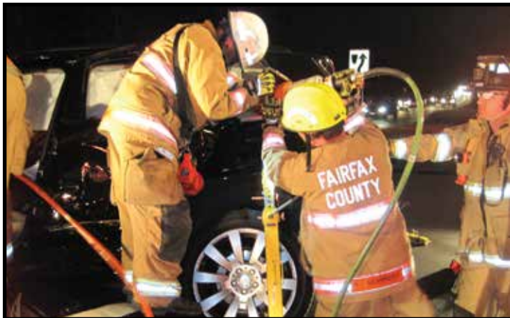
Firefighters extricate a trapped person in a two-vehicle crash in McLean.