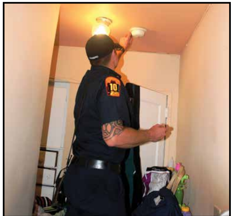
Preventing the 911 Call . . . firefighters install smoke alarms in homes throughout the county.