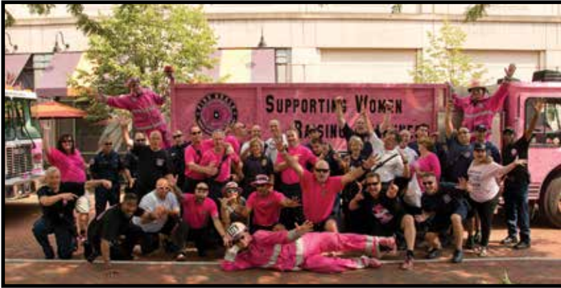
Community outreach . . . Firefighters wear pink and participate in the "Pink Heals" tour at the Reston Town Center.