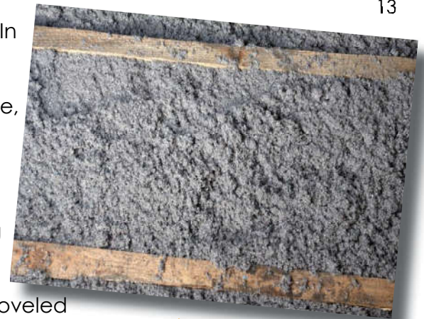
Cellulose Insulation

Although cellulose insulation is fire retardant, it poses a significant risk of fire and rekindle. The insulation hides smoldering embers well and allows travelling embers to light fires in various areas that the insulation covers. It is imperative that Incident Commanders and officers take appropriate actions to ensure the potential of fire is removed.