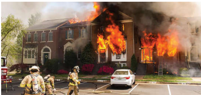
The Fairfax Way, Moving Forward.

Fire Investigators determined that the fire was accidental in nature and started on a third floor balcony. The fire was caused by the improper disposal of smoking materials. Approximately 125 residents have been displaced as a result of the fire. Damages as a result of the fire are estimated to be $10,128,475.