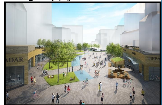
Conceptual drawing of the future Beacon Hill area on Richmond Highway.

The County's ambitious planning effort called Embark Richmond Highway (right here in Mount Vernon!) has won the 2018 Commonwealth Plan of the Year Award from the American Planning Association's Virginia Chapter. Embark is a sweeping, new land-use plan that supports walking, biking and a bus rapid transit , or BRT, system along Richmond Highway. The plan transforms the 7.5 mile corridor into a multi-modal destination , featuring a series of vibrant, mixed-use places that are connected with continuous walking and bike paths in addition to the BRT system . The three-year effort involved multiple county agencies and community representatives, including the Mount Vernon and Lee Supervisors Offices , Department of Planning and Zoning, Department of Transportation, Office of Community Revitalization, Park Authority and a 13-member community advisory group . More details.