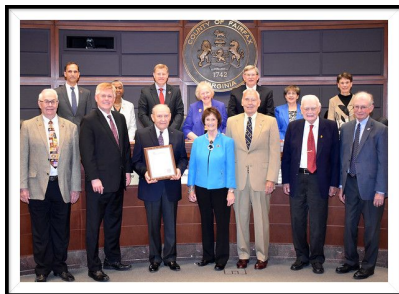
75th Anniversary of the D-Day Invasion