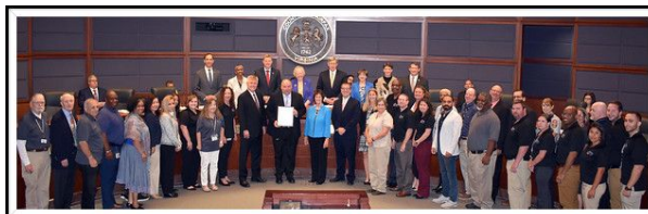
Office of Emergency Management and Resident Volunteers for their Work in Creating the New Community Emergency Response Guide