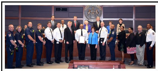
June 16 - 22, 2019 Safety Stand Down Week