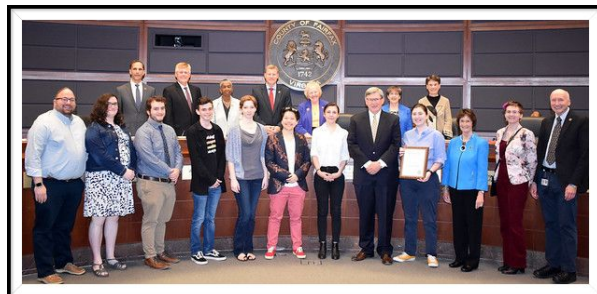
June 2019 LGBT Pride Month