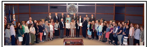
50th Anniversary of the Community Services Board