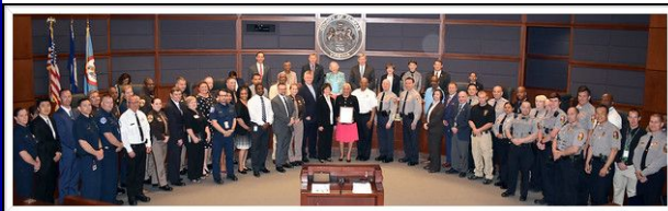
Fifth Anniversary of the Communities of Trust