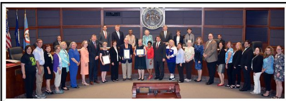
GrandInvolve for being awarded the Best Practice Award by the Commonwealth Council on Aging