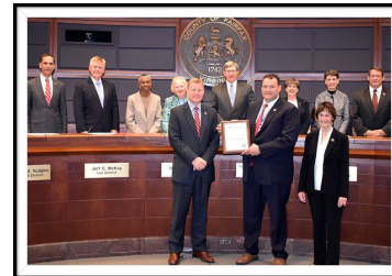
May 2019 Autism Awareness Month