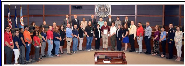
May 2019 Building Safety Month