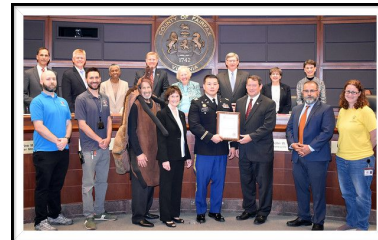
May 2019 Lyme Disease/Fight the Bite Awareness Month