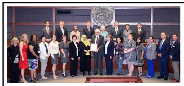
June 2019 Home Ownership Awareness