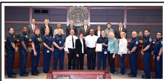
May 19 - 25, 2019 Emergency Medical