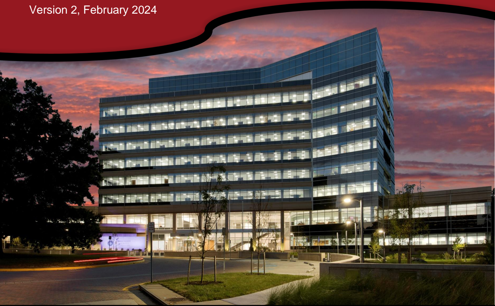
Public Safety Headquarters

Office of the Fire Marshal Engineering Plans Review Branch 12099 Government Center Parkway, 3 rd floor Fairfax, VA 22035 Tel: 703-246-4806, TTY 711 Fax: 703-246-6043 Email: fire.engplansreview@fairfaxcounty.gov OFM Homepage – https://www.fairfaxcounty.gov/fire-ems/fire-marshal