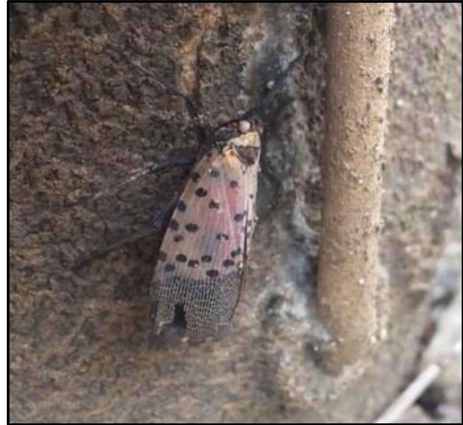
Spotted Lanternfly Adult January, 2018 Winchester, VA

All insect populations, are cyclical in nature. Periods of high pest levels are followed by periods of low pest levels.