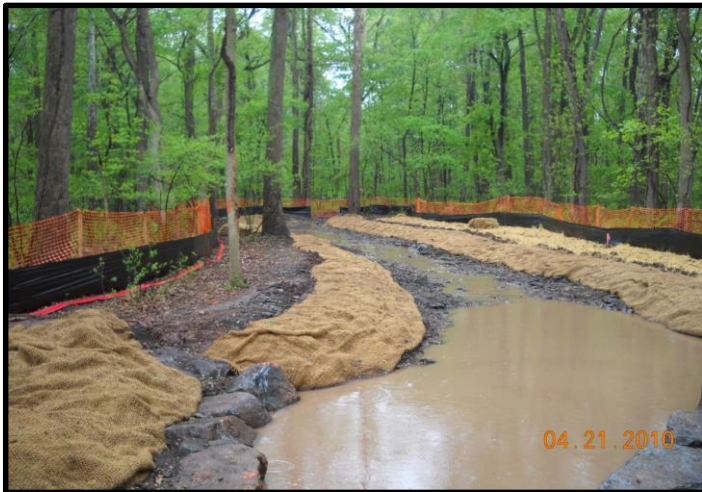
At time of construction