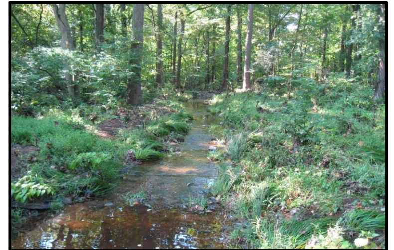
One year after construction