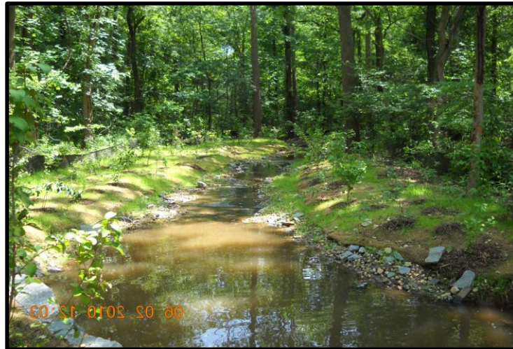
Three months following construction