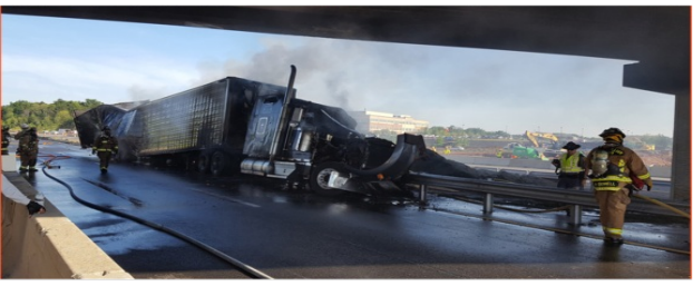
Join VDOT and our public safety partners to learn how we work as a team to quickly clear incidents from our roads. Walk through a crash scene, see response vehicles, and meet responders!

vdotopenhouse.eventbrite.com | @vadotnova