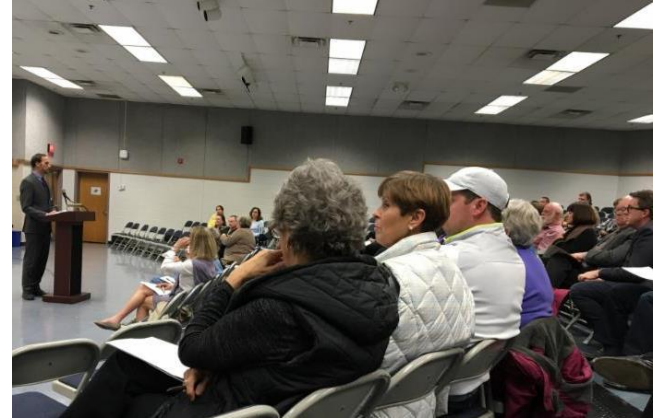
Bock Farm Community Meeting held in the lecture hall Walt Whitman Middle School

commission to allow the applicant the opportunity to bring forward an updated proposal. The formal language is below: