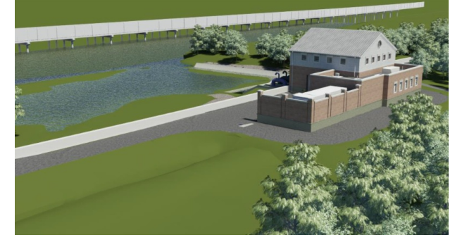
Rendering - Looking Northeast Toward Pump Station

provided an overview of the project, discussing the project status and sharing upcoming construction steps. Stormwater planning experts from the County's Department of Public Works and Environmental Services (DPWES) were available to answer questions. The key takeaways from the meeting were that the project is on time and paid for.