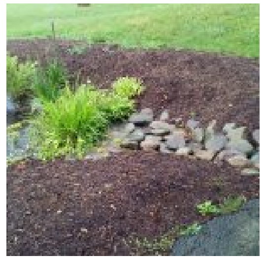
Rain Garden in action