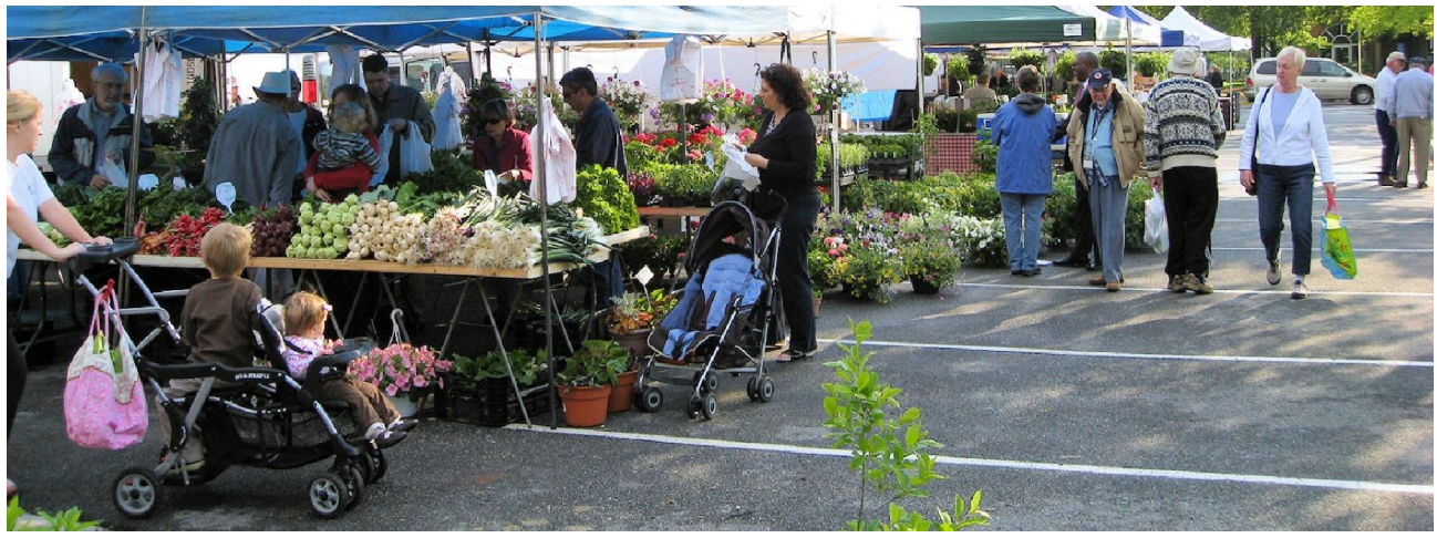
McCutcheon/Mount Vernon Farmers Market