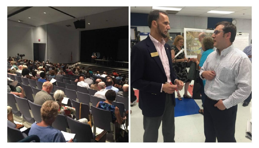
Embark Community Meeting, West Potomac High School

View the lead story on the front page of the July 27, 2016 issue of the Mount Vernon Voice.