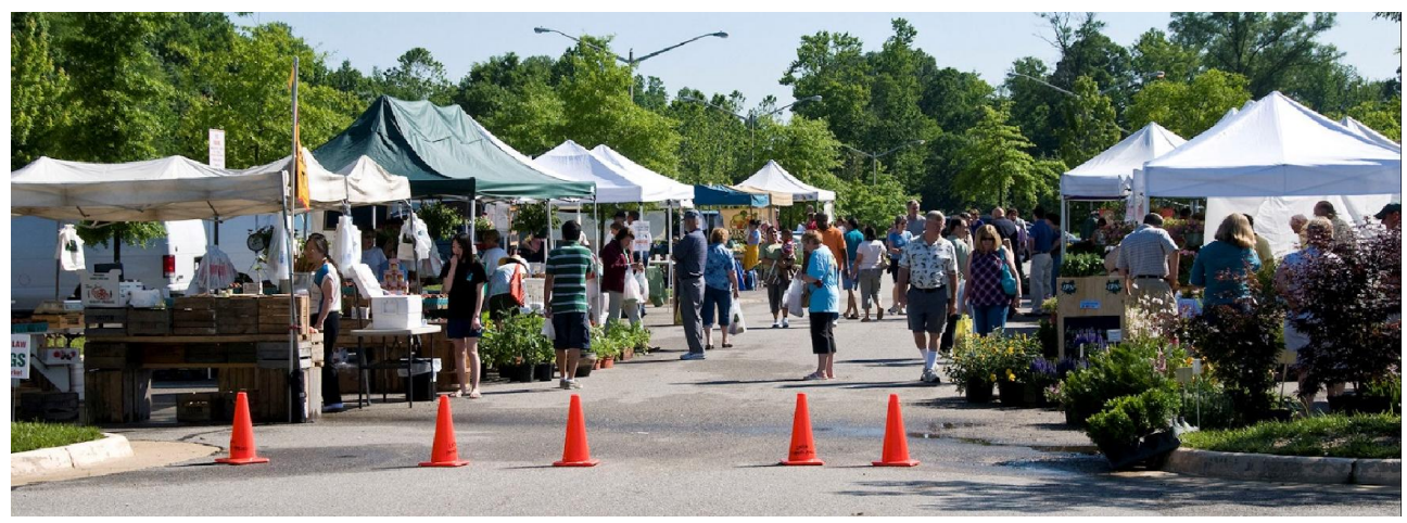
Lorton Farmers Market

Practice heat safety wherever you go this summer. <u>Learn more about extreme heat</u> and how to stay safe, as well as precautions to take for the vulnerable and pets. Find more heat safety related tips at <u>www.weather.gov/heat</u>.