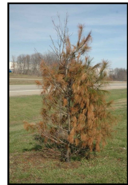
Photo courtesy Bert Cregg The Informed Gardener www.GardenProfessors.com

When salt is sprayed onto roads, it may travel up to 50 feet beyond the application site, affecting the nearby roots of street trees. Trees absorb salt when they take up water from the soil and from the air. Too much salt can reduce growth or cause trees to 'die of thirst' because salt prevents trees from retaining water. If soils are also compacted, salt damage may be worsened.