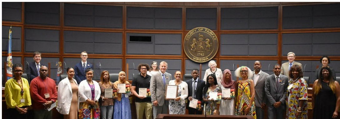
June 19 as Juneteenth*

*These presentations were held while I was at the Mount Vernon High School Graduation.