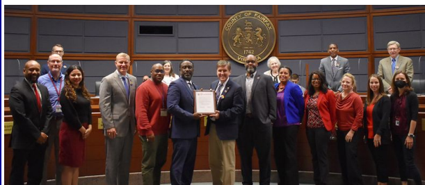
June as Fatherhood Awareness Month*