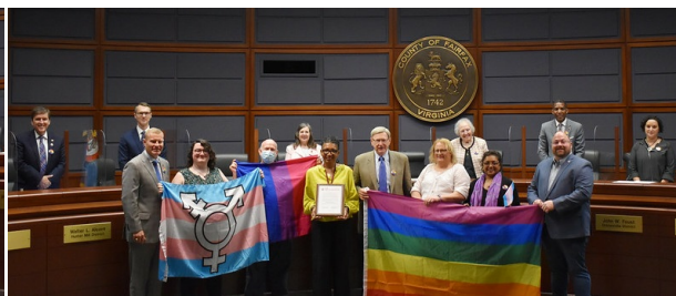
June as LGBTQ+ Pride Month*