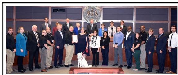
Recognized the Business Emergency Operations Council and designated September 2019 as Preparedness Month