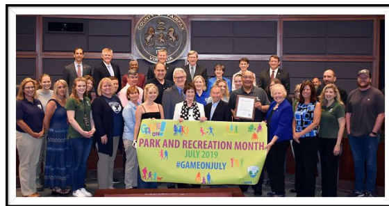
July 2019 as Parks and Recreation Month