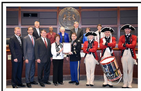
June 22 - 29, 2019 as Army Week