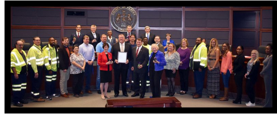
20th Anniversary of Volunteers in Police Service

To view the November 19, 2019 Board Package click here .