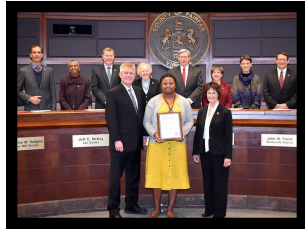
November 2019 as Native Indian Heritage Month