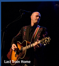
Last Train Home