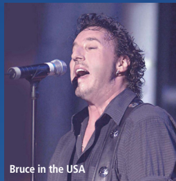
Bruce in the USA